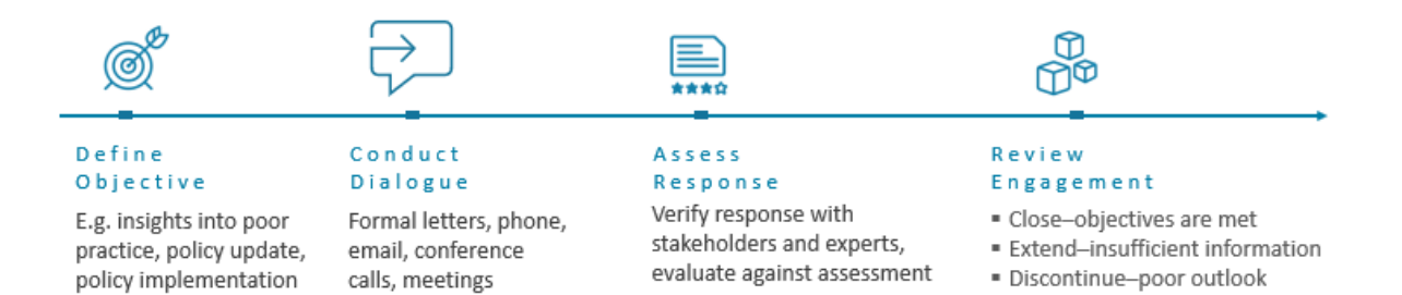
Figure 1: Simplified Norm-Based Engagement process.

Information provided by the company through the dialogue and interactions under the Norm-Based Engagement process is assessed against the objectives established at the outset of engagement and then a decision is taken on the outcome of the engagement. Where the fulfilment of the objectives has been met and a determination made that the controversy, or the risk thereof, has been resolved, the engagement will be closed. If there is insufficient information to determine whether the fulfilment of objectives have been met, the engagement will be extended. Alternatively, where there is a poor outlook for the achievement of objectives for the engagement, the engagement will be discontinued.