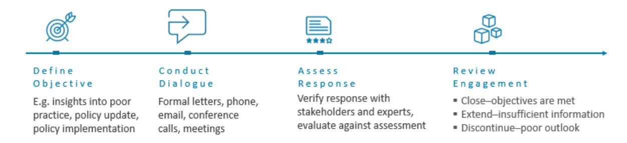
Figure 1: Simplified Norm-Based Engagement process.

Information provided by the company through the dialogue and interactions under the Norm-Based Engagement process is assessed against the objectives established at the outset of engagement and then a decision is taken on the outcome of the engagement. Where the fulfilment of the objectives has been met and a determination made that the controversy, or the risk thereof, has been resolved, the engagement will be closed. If there is insufficient information to determine whether the fulfilment of objectives have been met, the engagement will be extended. Alternatively, where there is a poor outlook for the achievement of objectives for the engagement, the engagement will be discontinued.